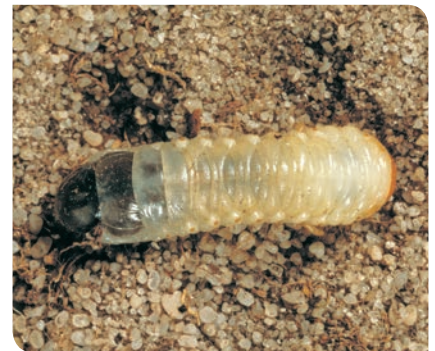
African black beetle larva.

ABB larvae have six legs, a brown head capsule, and a 'C-shaped' body. The larval body is grey in appearance when young but transitions to creamy-white when mature. They are ~5 mm when they hatch, growing to ~25 mm in length. The larvae damage pastures by pruning or completely severing grass roots close to the crown of the plant. In severe cases where infestation occurs, pastures become patchy and can be rolled back like a carpet.