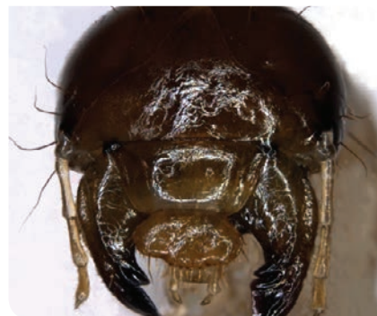
ABB, redheaded pasture cockchafer and blackheaded pasture cockchafer head capsules, respectively.