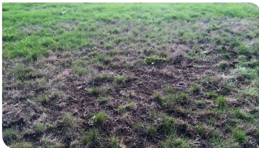
African black beetle pasture damage.

ABB has a one year life cycle. Adults lay their eggs in the soil in spring, and larvae emerge in 2–5 weeks depending on temperature, and reach the most damaging third instar larval stage from mid-January to March. 1 Larvae then pupate in the soil and emerge as adults, which go on to feed on pastures and crops throughout autumn, winter and spring.