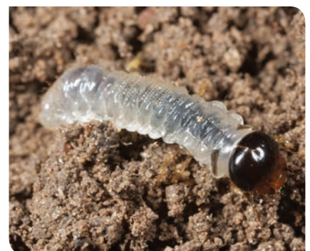
Blackheaded pasture cockchafer larva.

Main image: African black beetle adult.